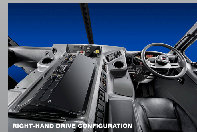
RIGHT-HAND DRIVE CONFIGURATION