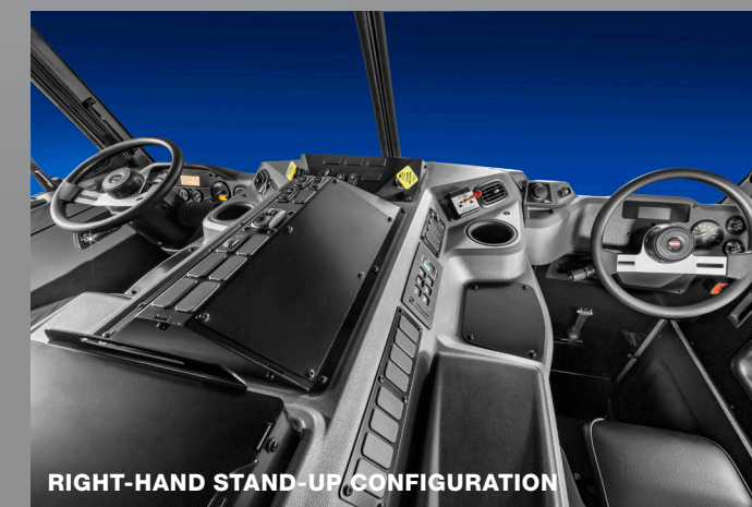
RIGHT-HAND STAND-UP CONFIGURATION

Pantograph windshield wipers provide more coverage for improved visibility and safety.