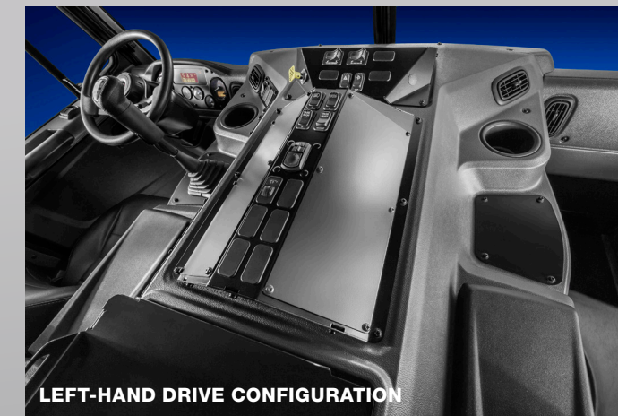
LEFT-HAND DRIVE CONFIGURATION

switches within easy reach for maximum driver comfort and productivity. Center console sides are angled, providing operators easy visibility and access to controls from either side. An enhanced HVAC system improves airflow and climate control in the cab.